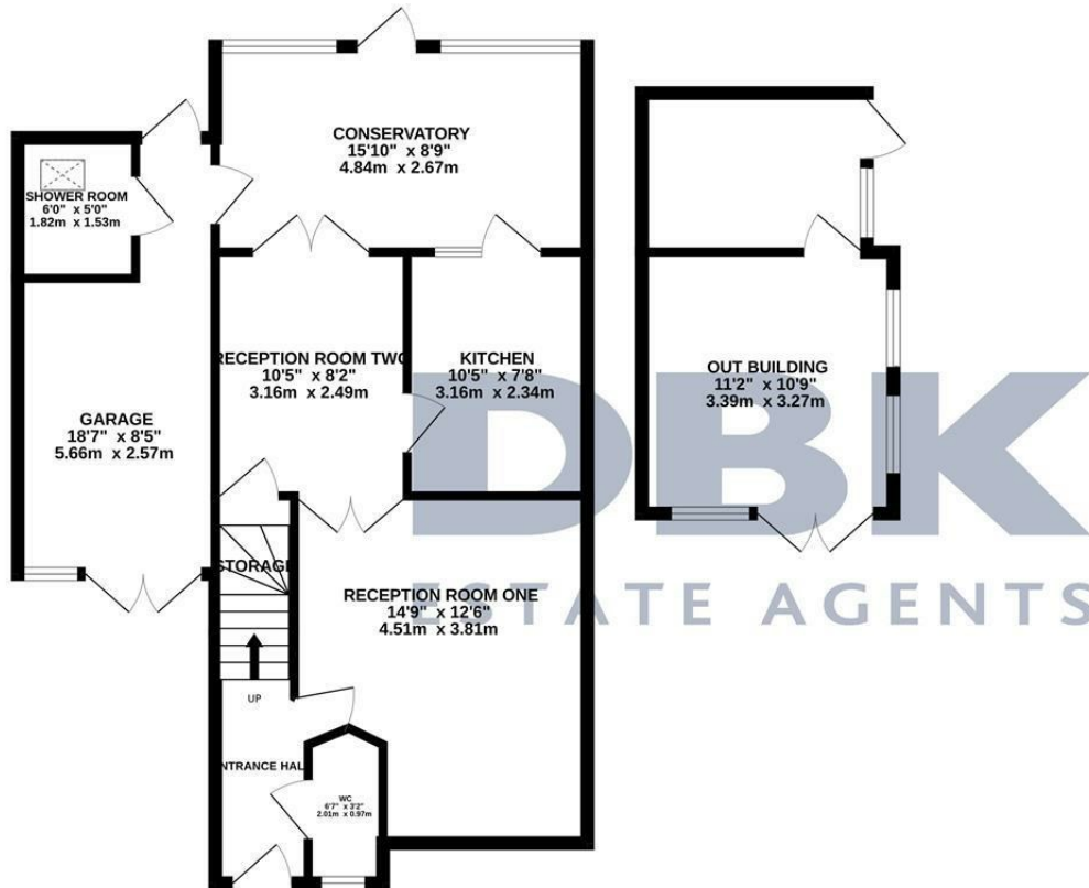
GROUND FLOOR 892 sq.ft. (82.8 sq.m.) approx.